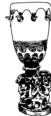
Pedestal Drum, Ivory Coast